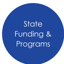
Working Group 1

The following five (5) Working Groups will be formed during FY 21-22 and FY 22-23.