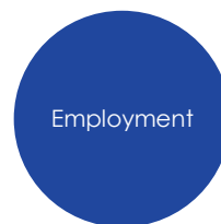
Working Group 4