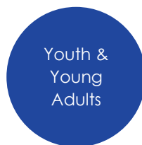
Working Group 3