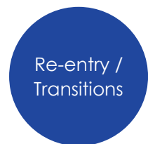
Working Group 5